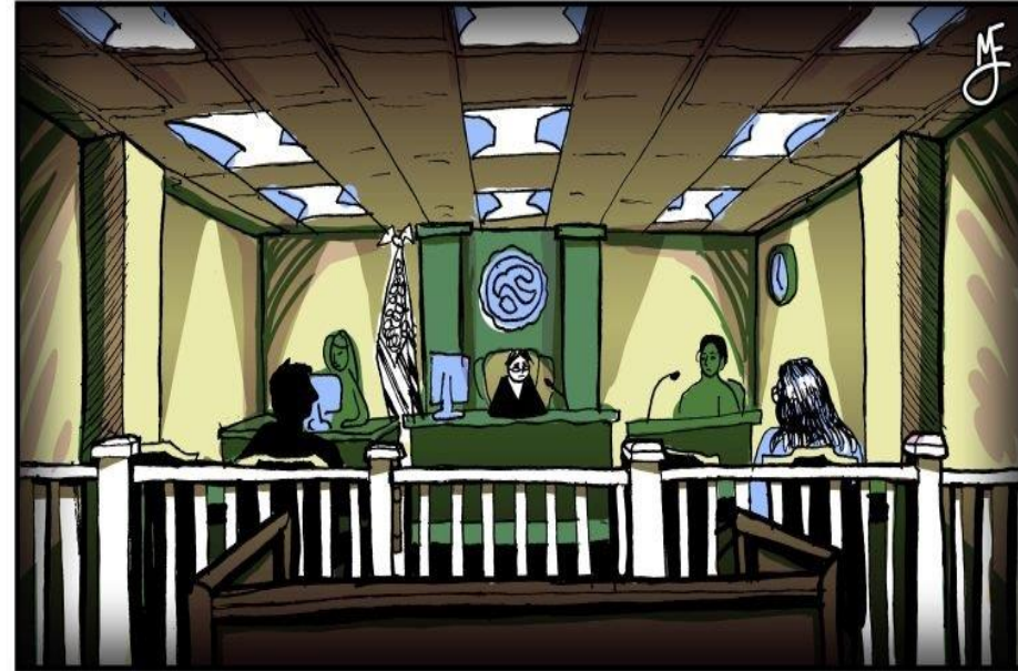
Représentation d'une audience typique du tribunal de l'immigration.