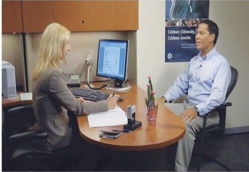
Entretien avec un agent USCIS chargé des questions d'asile